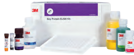
3M™ Allergen Protein ELISA Kits.