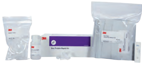
3M™ Allergen Protein Rapid Kits.