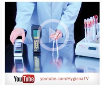
Watch an instructional demo at youtube.com/HygienaTV

MicroSnap E. coli is a rapid test for detection and enumeration of Escherichia coli . The test uses a novel bioluminogenic reaction that generates light when enzymes that are characteristic of E. coli bacteria react with specialized substrates. The light generating signal is then quantified in the EnSURE luminometer. Results are available in 8 hours or less, depending upon required level of detection. Single figure organisms can be detected in 8 hours, delivering results in the same working day or shift.