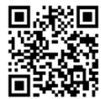
Find support documents, instructional videos, and more at www.hygiena.com