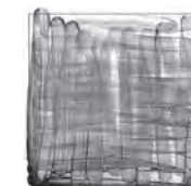
AccuPoint Sampler Pattern